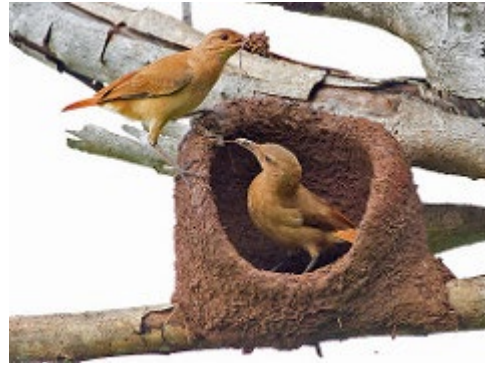
Rufous Horneros building nest