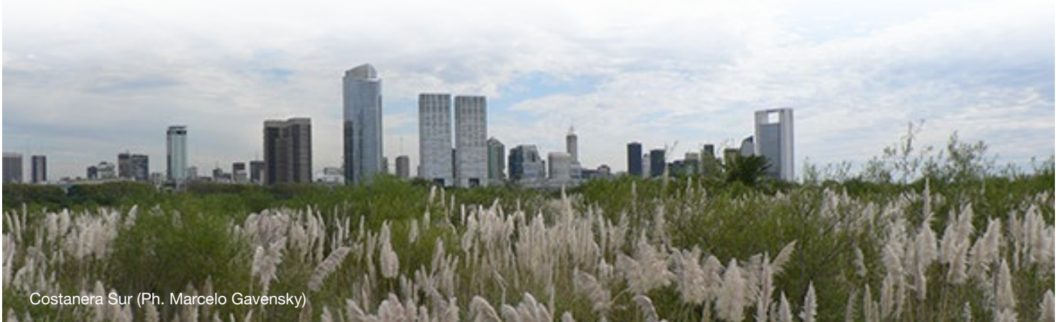
Costanera Sur

Tiger Herons, Southern Lapwing, Wattled Jacanas (gorgeous in flight), Silver Teal, Masked Duck, Rosy-billed Pochard, Coscoroba Swan, Southern Crested Caracara, Chimanga Caracara, Green-bared and Checkered Woodpeckers, Picazuro Pigeon, Rufous Hornero (the national bird of Argentina) and its unusual clay nest, Red-crested Cardinal, Golden-billed Saltator—and I could go on. Sixty-five species in all, most of which were lifers! The overall Buenos Aires experience was unique culturally and the birding was spectacular.