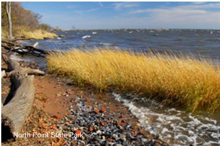
North Point State Park

AUG 27–NORTH POINT STATE PARK – North Point in late summer is a great place to see Little Blue Herons, in both adult and immature plumage. On this trip we saw at least 14 Little Blues. A flyby Lesser Yellowlegs passed within a few feet of us, providing great looks. A continuing Royal Tern was a nice contrast to the expected Caspian Terns. Passerines were sparse. 38 species. 9 participants. Leader: Peter Lev.