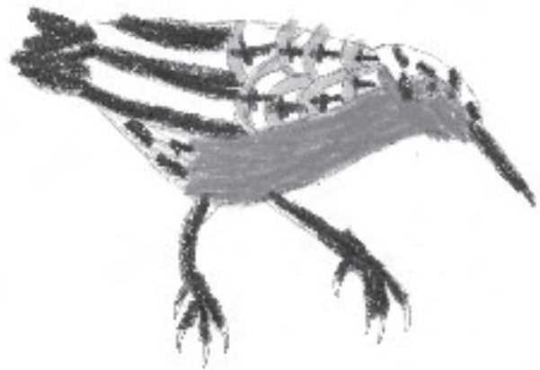
POSTCARD IMAGE USED IN CAMPAIGN

Friends of the Red Knot was born through a club of dedicated kids ranging in age from 7 to 13. After collecting information on the Red Knot and Horseshoe Crab and drafting a letter to former Secretary of the Interior, Dirk Kempthorne, we