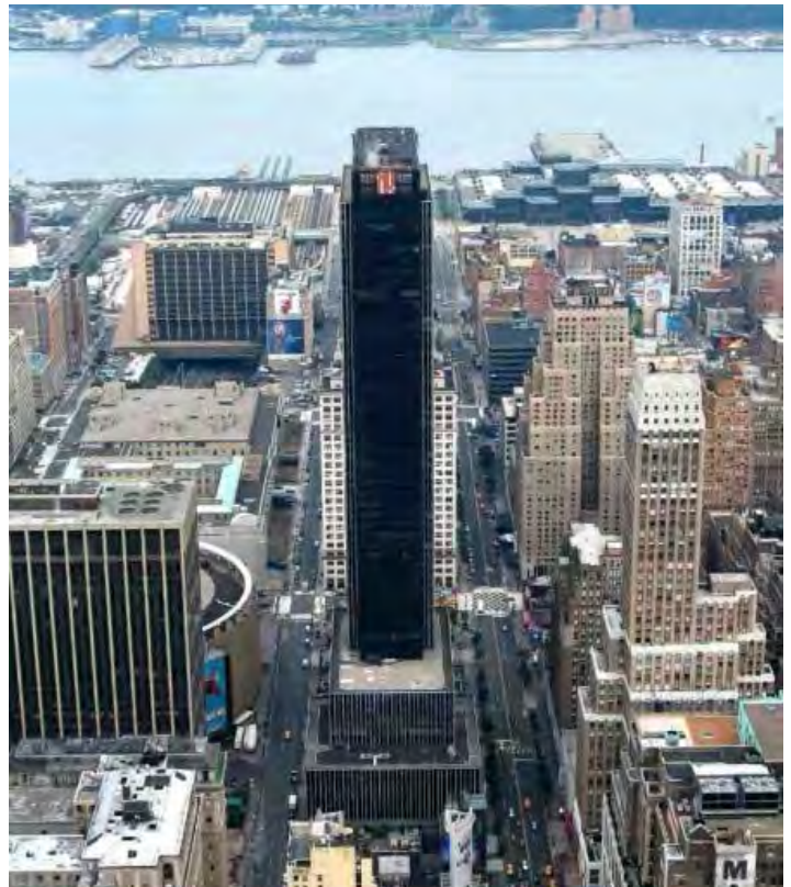
Baltimore’s view of Manhattan from perch

This owl will be the owl supported by the Martin Fund donation and it will be named “Baltimore” in honor of the bird club and the city. Again - Thank you for the donation! I was so glad that we could turn it into a transmitter on an owl in Maryland almost immediately.