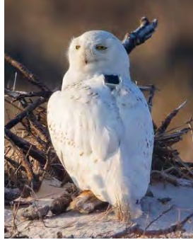
Baltimore with transmitter

SNOWstorm to purchase a transmitter for snowy owls. And we lucked out--an owl was shortly thereafter captured locally at Martin State Airport (March 14th) and became the recipient of our transmitter. Because