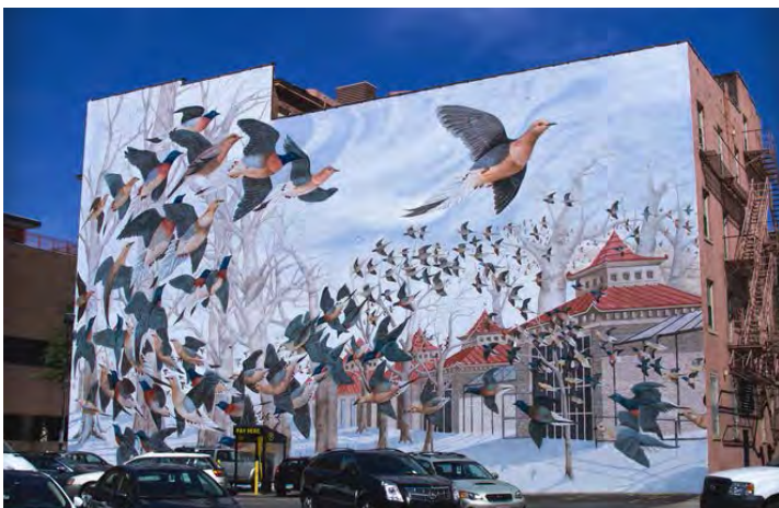
Passenger Pigeons, Cincinnati

What a thought—building murals as avian message boards! BBC artists are already using art as a powerful tool to speak to the plight of birds from glass strikes (see the article on Unfriendly Skies). It seems these visual messages are broadcasting our message in a powerful way!