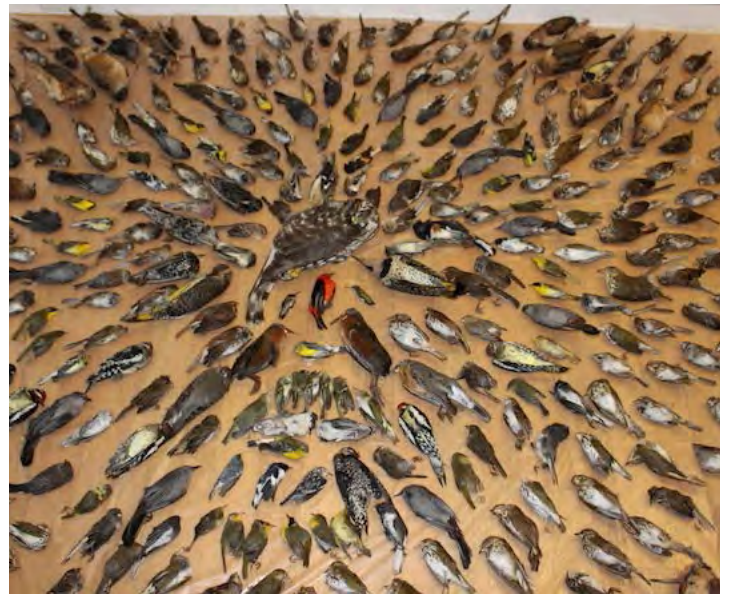
LOB floor mandala