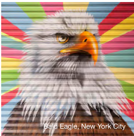
Bald Eagle, New York City