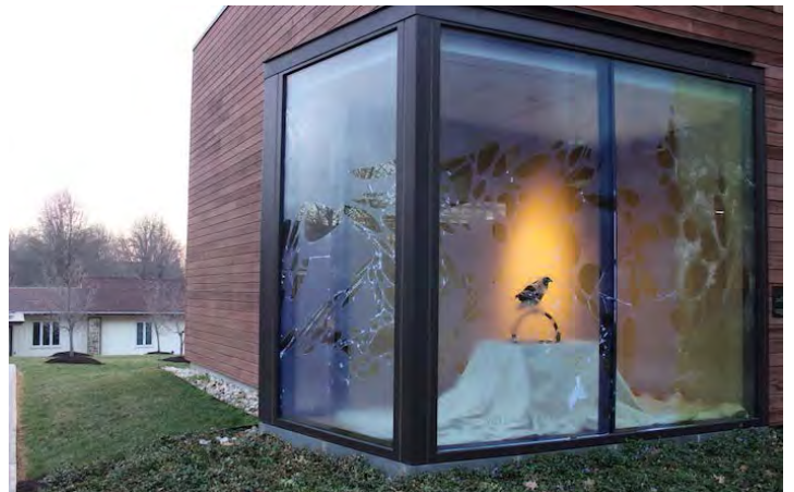
LOB display with live Red-tailed Hawk

I spent days diagramming the Inner Harbor so that four of us (the artists helped me) could lay down a tape installation depicting the route LOB volunteers walk and I added numbers to the buildings showing how many fatalities had been collected at each site (Lindsay found a volunteer to collate data). For such a somber subject, we nonetheless enjoyed the work. It's a happy thing when ideas and implementation pull people together. It was exciting to watch the installation artists' processes. One would rummage through the