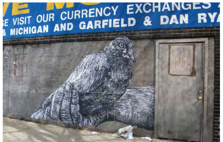
Fragile Hands, Baltimore