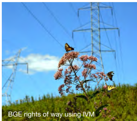
BGE rights of way using IVM