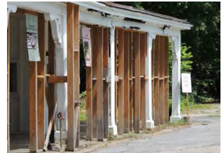
The Carriage House as it is today

Beginning in mid-December, the Carriage House Nature Museum will be closing...at least for the foreseeable future! All of its contents—mounted birds and animals, eggs and nests, shells and skulls, rocks and books, butterflies and general bric-a-brac will be removed and put into long-term storage. Why, you ask?