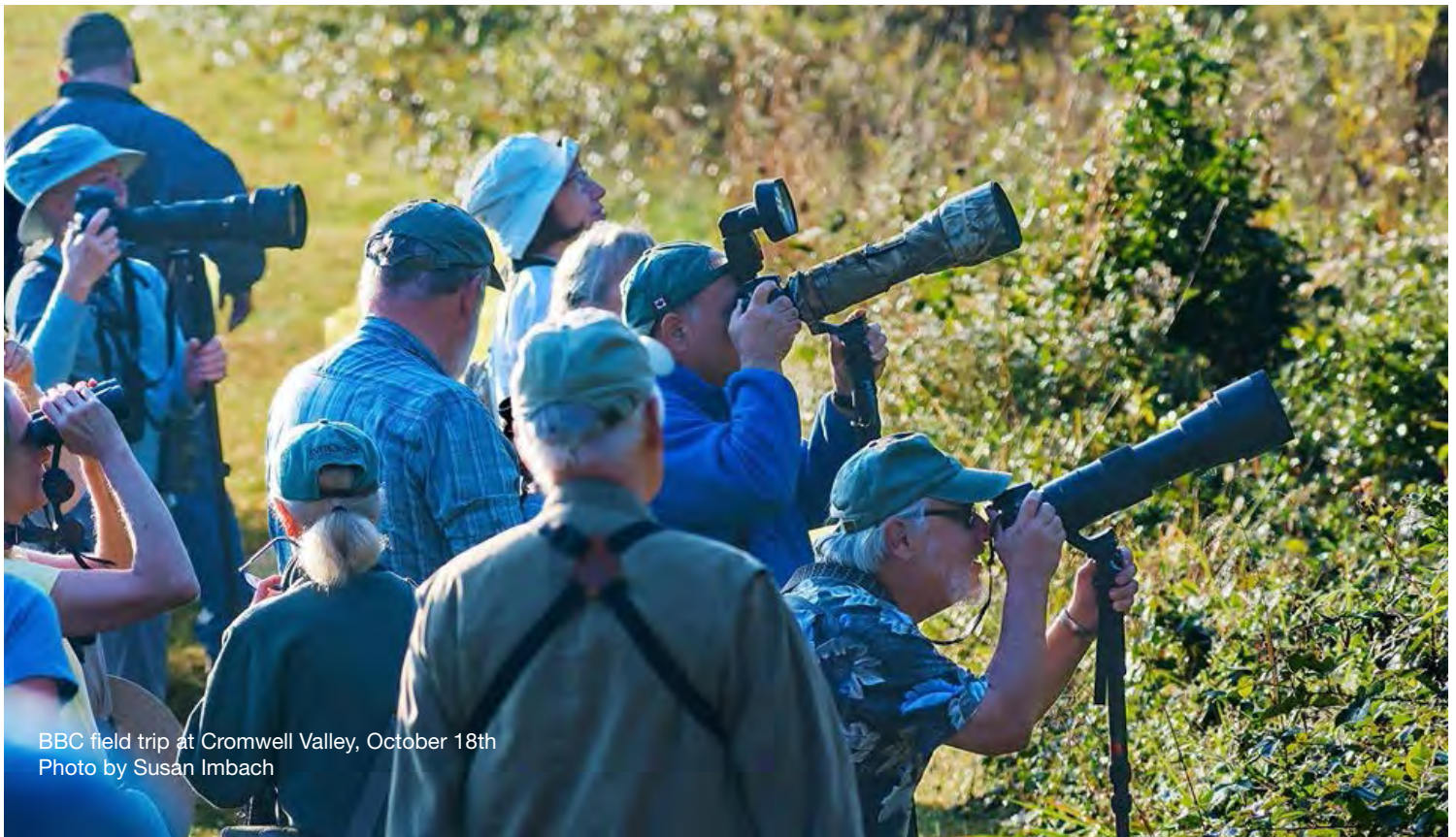
BBC field trip at Cromwell Valley, October 18th

SEP 18 - Gwynns Falls/Leakin Park - This trip featured a good view of a Yellow-bellied Flycatcher and a brief look at a flying Solitary Sandpiper. A Kingfisher was heard. Only a few warblers were seen, including Common Yellowthroat, American Redstart, Black-and-white and Magnolia Warblers. 36 species. 8 participants. Leaders: Paul & Elise Kreiss.