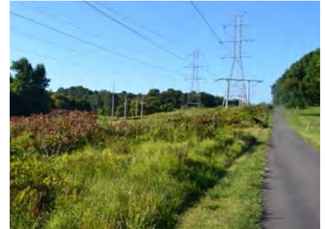
BGE IVM rights of way

Have you ever given much thought to power line rights of way? The most obvious ones in our area are those often barren-looking (especially after they've been mowed) or messily overgrown