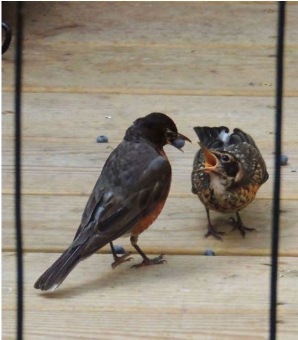
Rogue feeding fledgling. Note the hanging Acopian strings to protect window from bird strikes.

For the past 30 years we've been feeding birds on our second-floor deck, observing them from our kitchen table. During that time American Robins have occasionally stopped by, but seldom returned. That is until Rogue Robin found us this year!