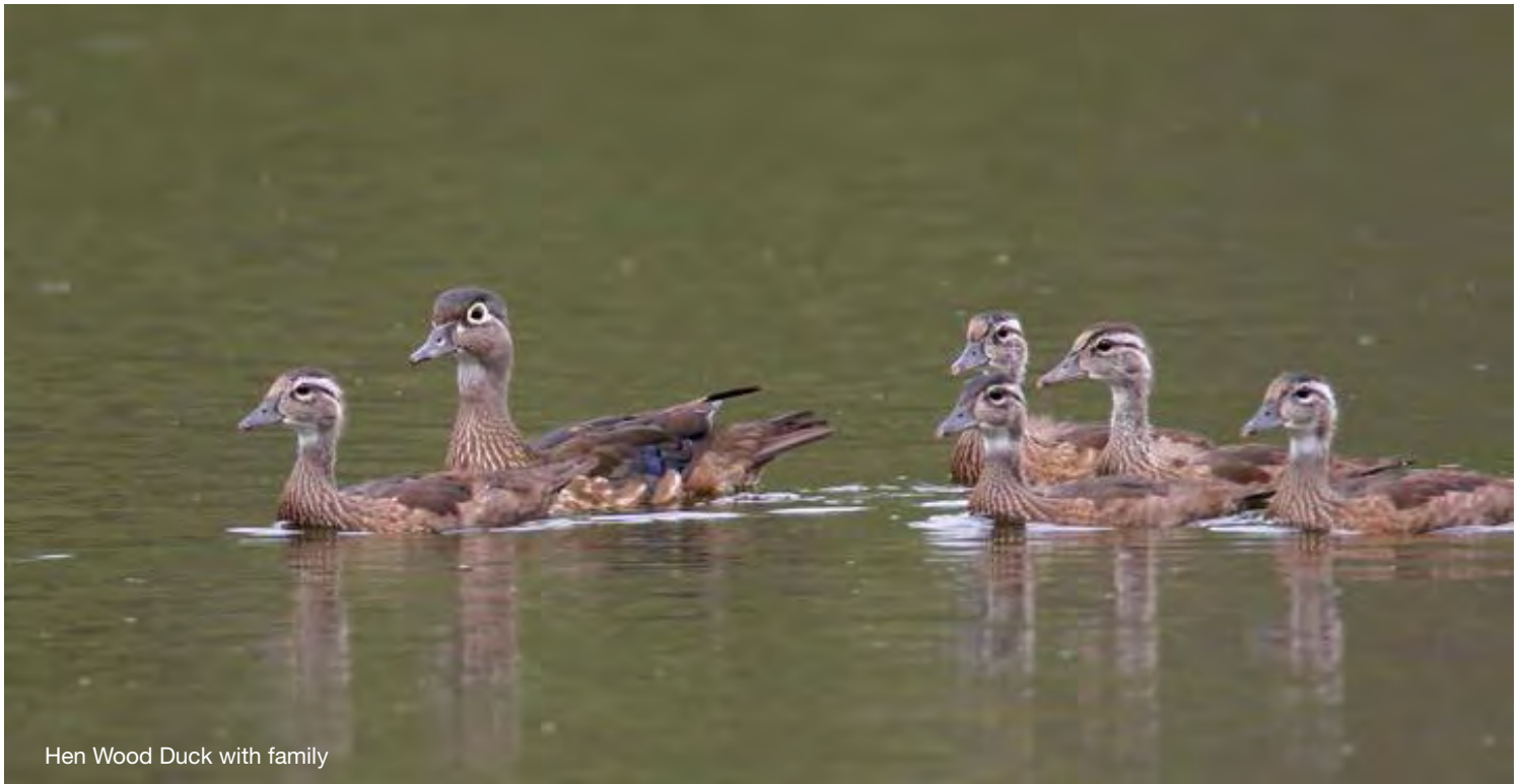
Hen Wood Duck with family

MAY 23 - Lake Roland - A cool, cloudy morning with the threat of showers ended our Tuesday morning spring walk at Lake Roland. The most aha moments were the great views of Pileated Woodpeckers peaking out of the nest, a Great Crested Flycatcher patiently perched on a bare tree branch, and a mother Wood Duck with 12 babies paddling in the still water below the dike path. Always a good time being with those who love the birds. 62 species. 13 participants. Leader: Debbie Terry.