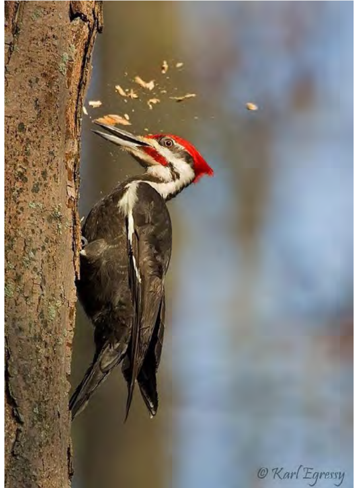
Pileated Woodpecker chipping away!

Woody, as he was now called, was in a cardboard box with a blanket covering it. We put the box in my car and fastened the seat belt. Woody and I started the return ride home of about 12 miles.