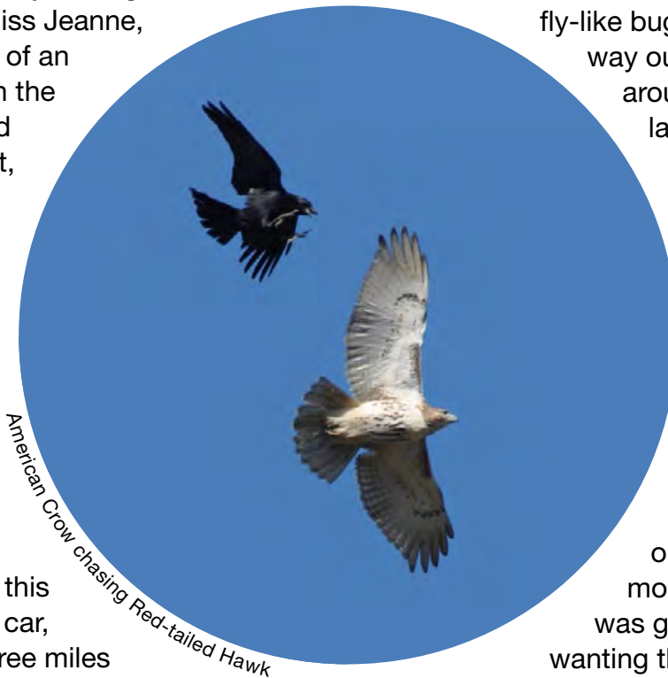
American Crow chasing Red-tailed Hawk