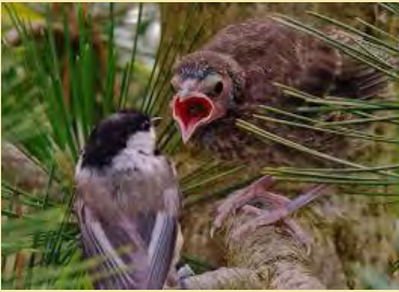
Chickadee feeding cowbird fledgling

Cowbird. Scientists have wondered for years about how cowbird chicks can identify with cowbirds if they were raised by other bird species.* How do they learn to sing, find food, find a mate of their own species when not raised by their own biological species? In the Audubon Newsletter, May 2017, there is an article on recent research about how cowbirds recognize other cowbirds—through the use of “passwords” that only cowbirds can understand.