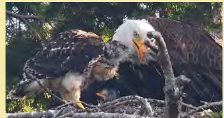
Hawklet in eagle nest

Red-tailed Hawk. Sometime in late May, a pair of Bald Eagles snatched up two Red-tailed Hawk chicks in Sidney, British Columbia and brought them back to their nest—alive! One became a meal for the three eaglets nesting there, and the other became a legend when the eagles took the hawk chick under their wings, so to speak! Scientists were stunned to see a four-and-a-half-week old Red-tailed Hawk nestled among three eagle chicks and feeding from the eagle's beak. How did it get there?