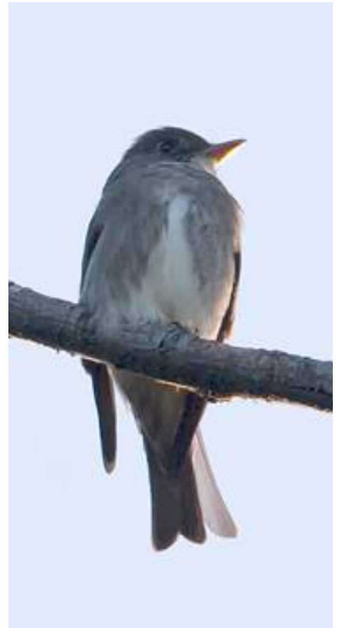
Olive-sided Flycatcher

An amiable group of six managed 39 species on a warm and drizzly mid-autumn walk. The changing season brought us the regulars like Yellow-bellied Sapsucker, White-throated Sparrows, kinglets and Hermit Thrushes. And 53 American Wigeon on the lake had us anticipating the rafts of ducks yet to come this winter. But this year's irruption of the not so regular Pine Siskins, Red-breasted Nuthatches and Purple Finches continued to impress.