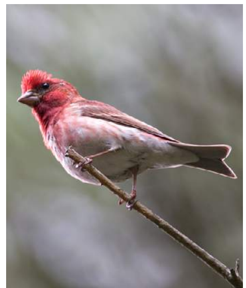
Purple Finch