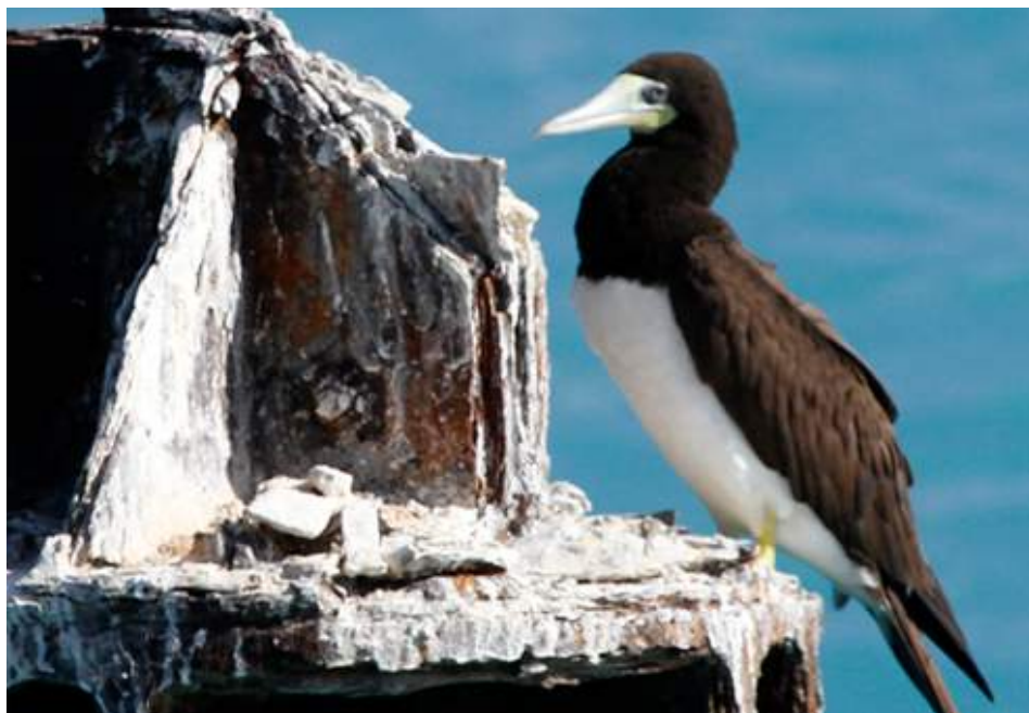
Brown Booby