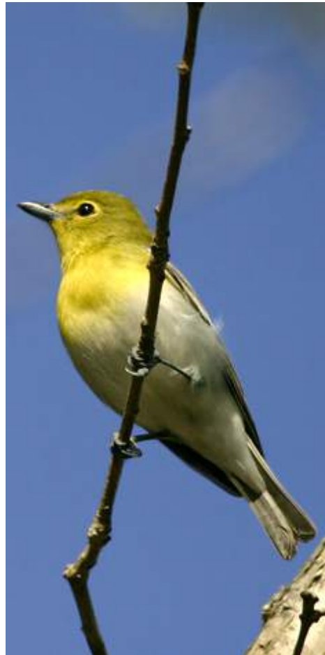
Yellow-throated Vireo

Multiple accipiters (5 Cooper's and 2 Sharp-shinned Hawks), Flickers (16), Thrashers (5), and Jays in migration. All possible woodpeckers but Red-headed. Purple Finch and Pine Siskins.