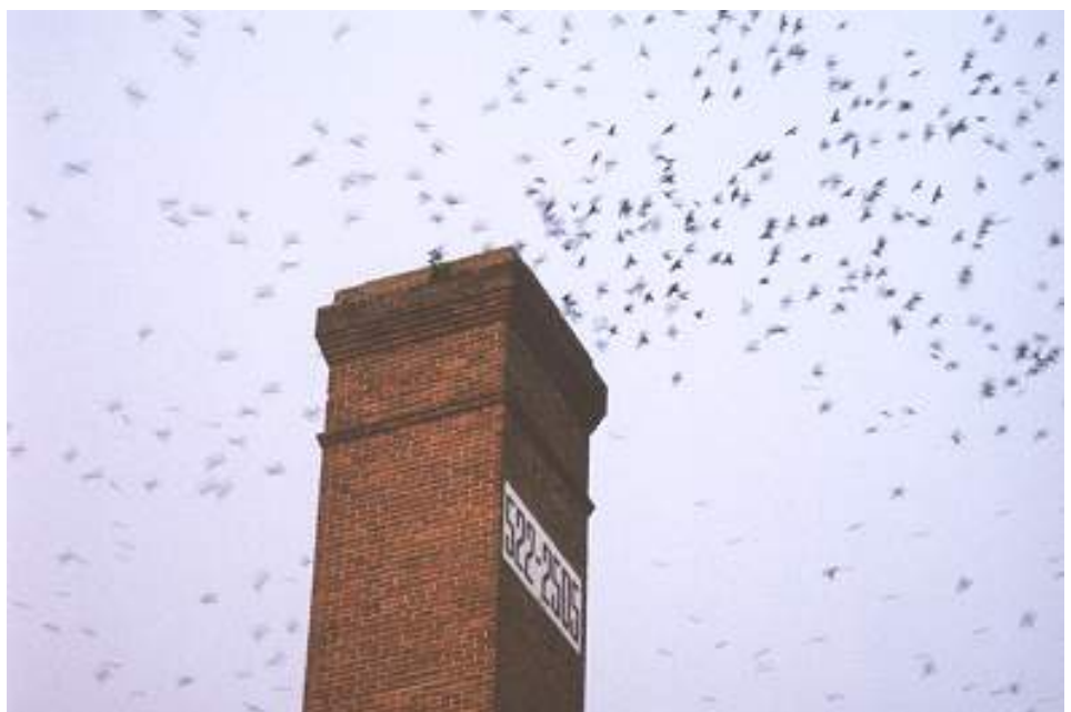
Chimney Swifts