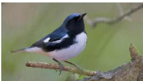
Black-throated Blue Warbler