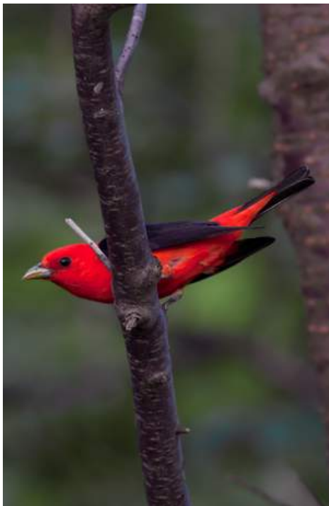
Scarlet Tanager

This trip was to a wonderful city location. 40 Broad-winged Hawks flying low overhead were special, along with multiple migrating warblers and 5 Scarlet Tanagers and 10 Eastern Pewees.