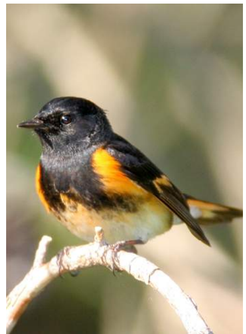
American Redstart