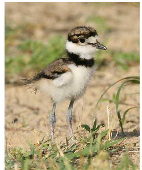
Killdeer