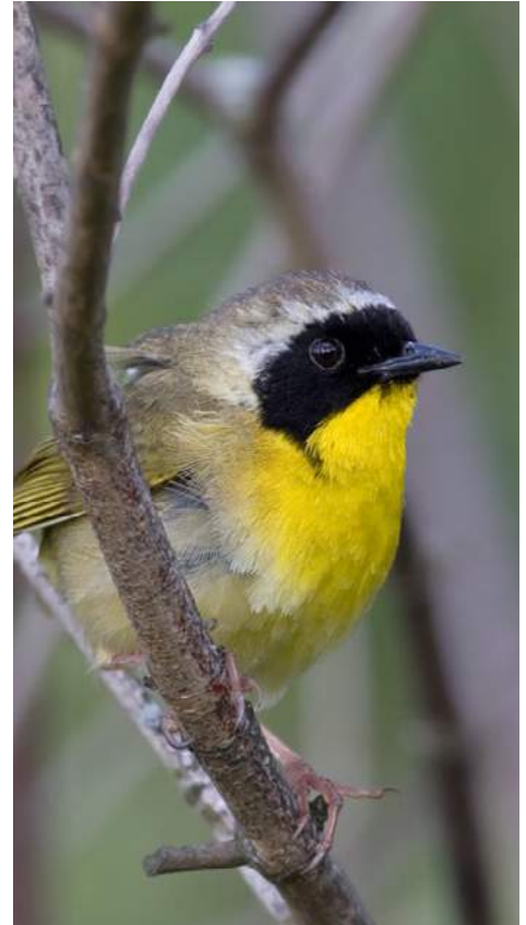
Common Yellowthroat

Three intrepid souls joined us in the rain, but after half an hour, the downpour abated. It was wet and gray, but we had close looks at seven warbler species including Magnolia, Black-throated Blue, and American Redstart. There were several Rose-breasted Grosbeaks often feeding on the path in front of us. A Swainson's Thrush showed up. We discussed stream restoration efforts.