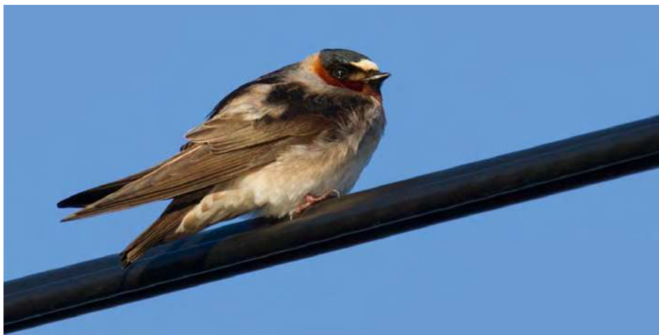
Cliff Swallow