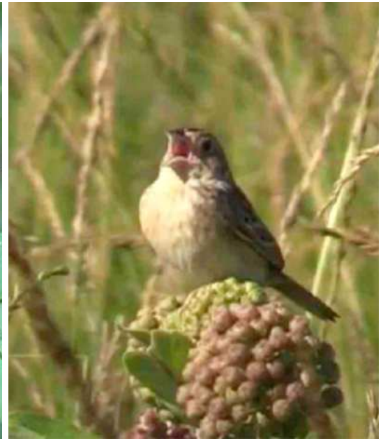
I like to film birds in action, such as this yellow-billed cuckoo feeding on a praying mantis or a grasshopper sparrow singing.