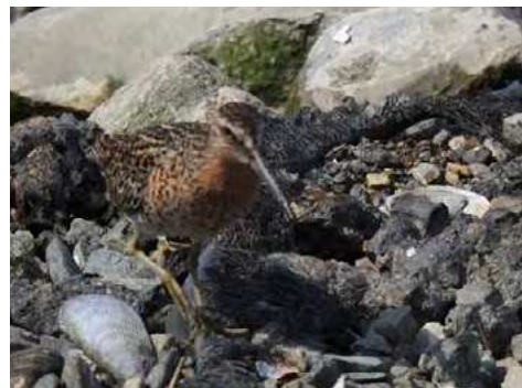
Two photos of Short-billed Dowitchers.