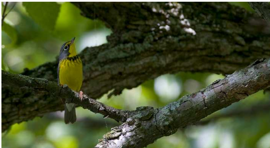
Canada Warbler

At these locations eight of us enjoyed some early post spring migration birding on a gorgeous day in Northern Baltimore County woodlands. Highlights were Cliff Swallows near Spooks Hill and breeding Worm-eating Warblers at Masemore.