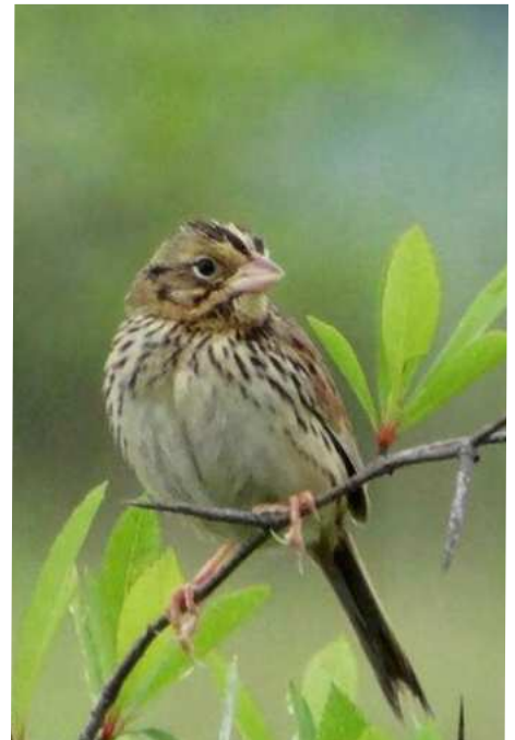
One of my newer and better photos - Henslow's Sparrow.