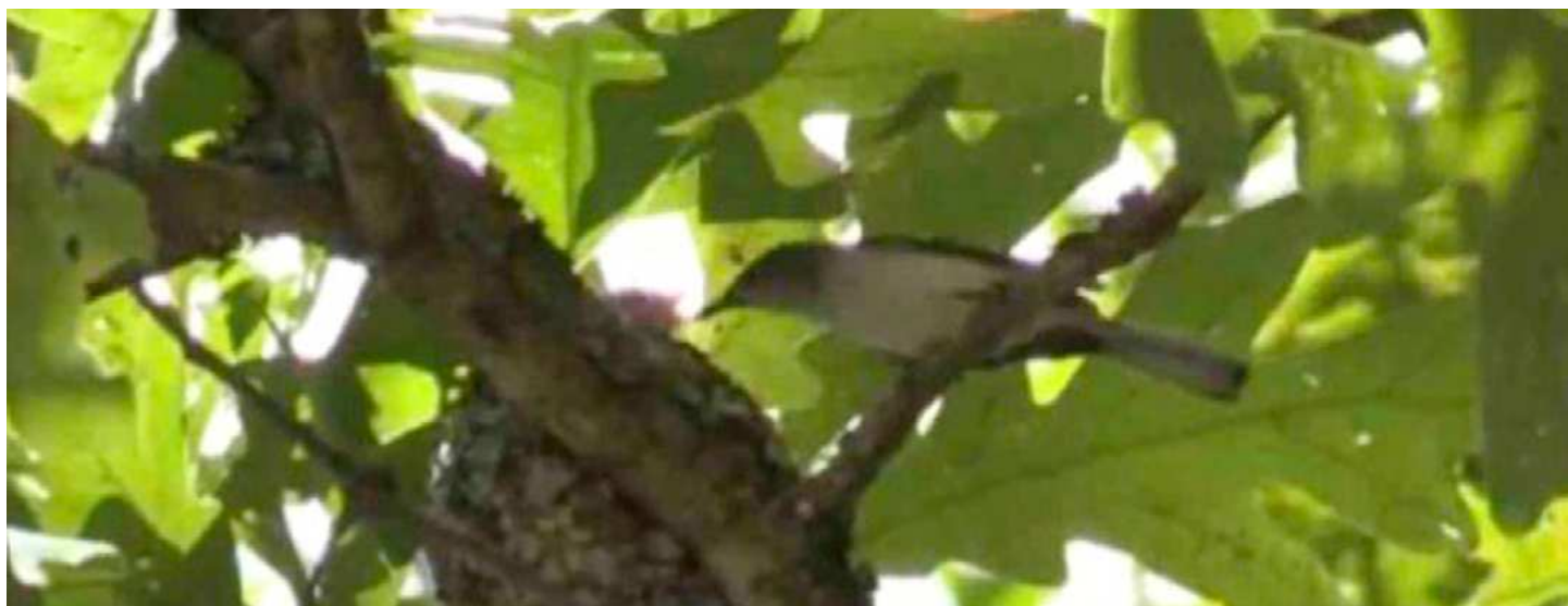
Blue-gray catcher nesting activity filmed while participating in the breeding bird atlas.