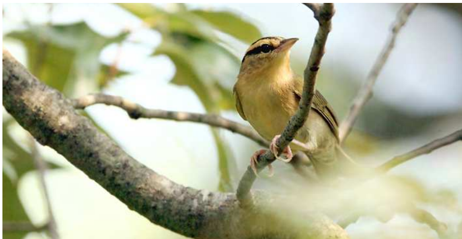
Worm-eating Warbler