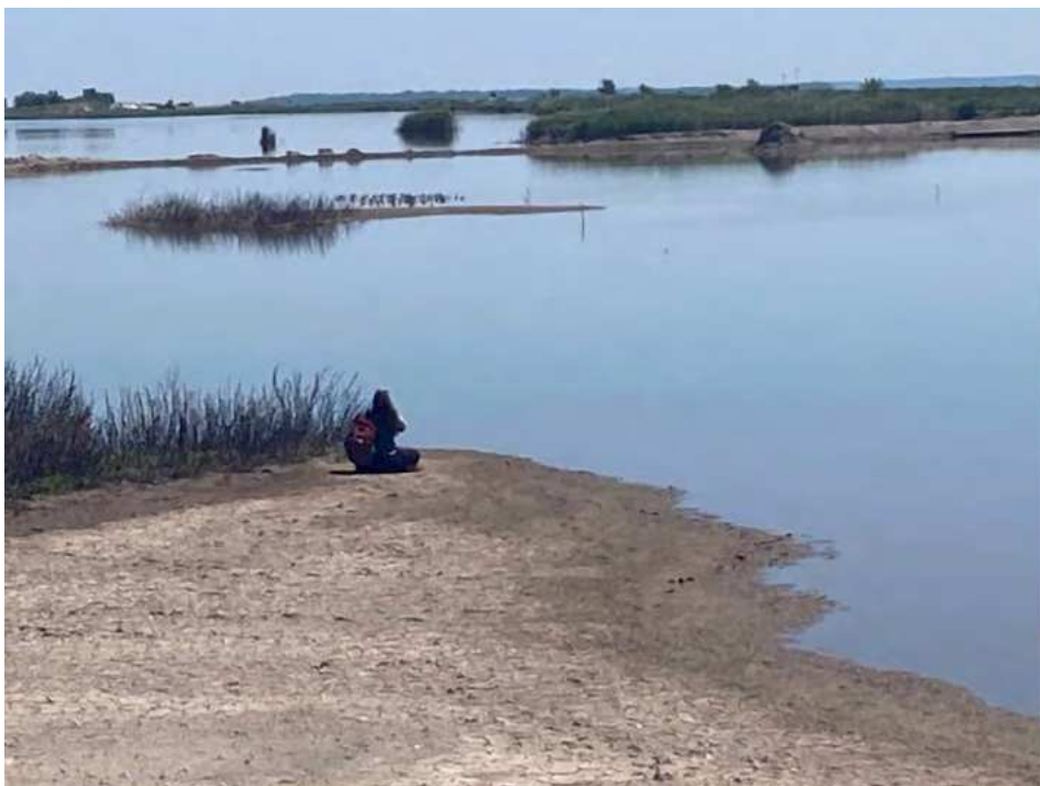
Libby Errickson surveying shorebirds at Hart-Miller Island.