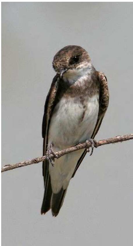
Bank Swallow