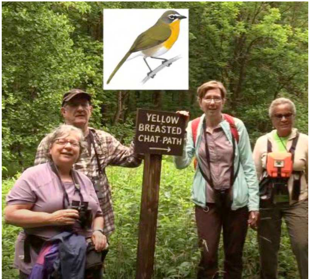
"Watching Birds Through Migration" CCBC class members now appear in my videos.