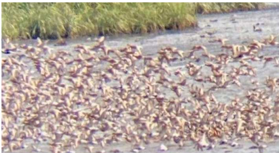
Red Knots and More.

This was an awesome shorebirds trip where we experienced many hundreds of shorebirds. Semipalmated Plovers and Semipalmated Sandpipers, Red Knots, Black-bellied Plovers, Short-billed Dowitchers, and Dunlin were in abundance. Some highlights were White-rumped Sandpipers, American Oystercatchers, Black-necked Stilts, and Clapper Rails, especially at Dupont. The seven of us saw over 30 species at the Dupont Center and 60 species at Bombay Hook.