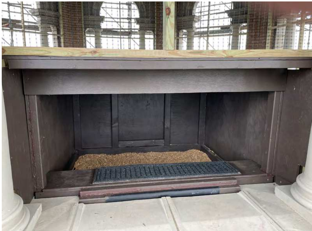
The Roland Water Tower now has a nesting box for Peregrine Falcons.