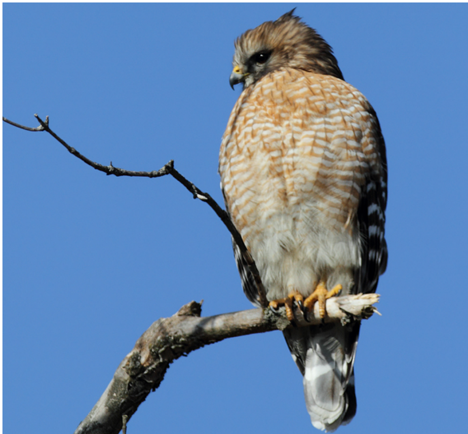
Red-shouldered Hawk

Although we started off slow and the weather seemed a little iffy, we ended up with a respectable list of 30 birds.