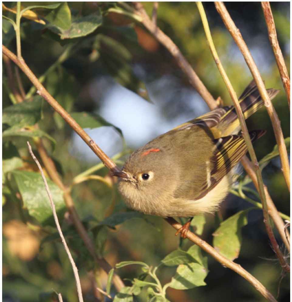
Ruby-crowned Kinglet