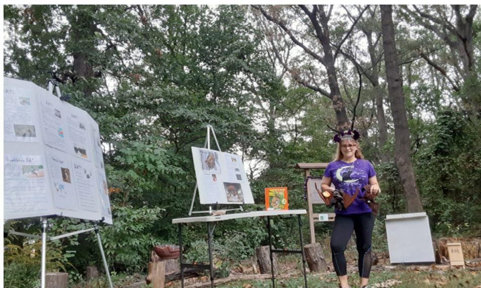
Above: Photos from the October 9, 2021 Fairwood Forest youth trip.