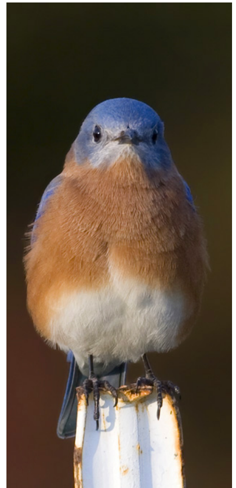
Eastern Bluebird

We took one of the charts and took a walk around the trails of Coppermine. We often see a lot of birds since we butt up against Lake Roland. I tell children that if you truly look, you will see at least 10 birds a day. We saw over that 10, and I was so glad since it