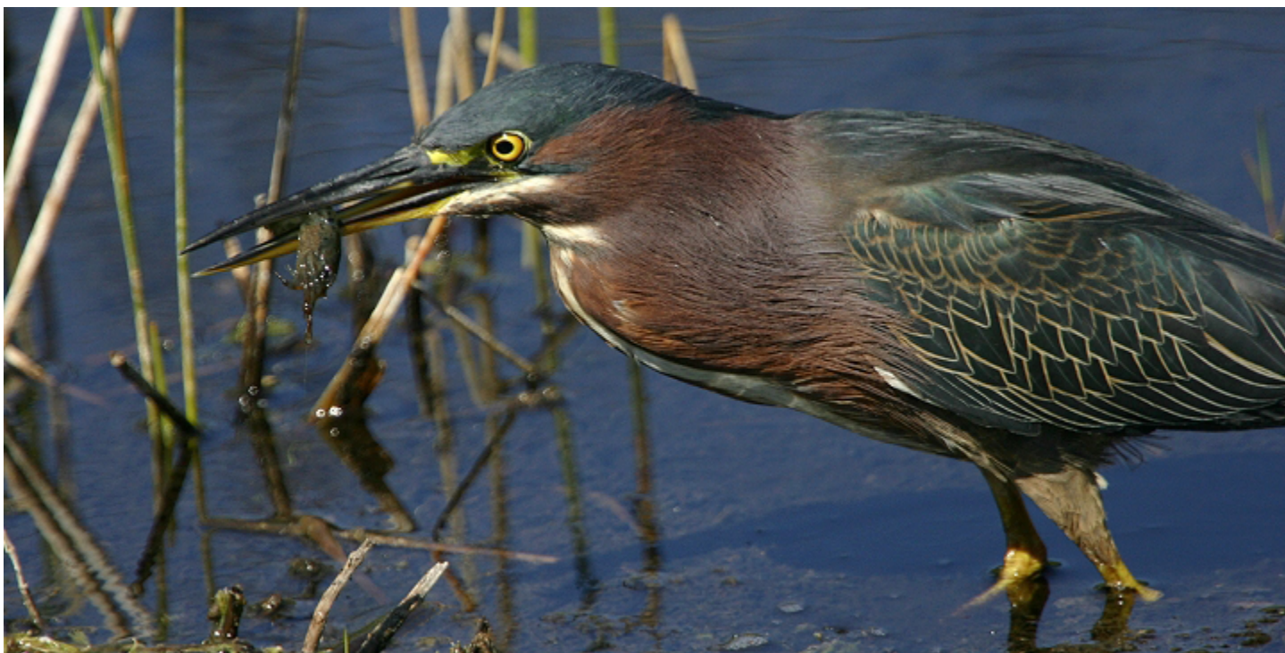
Green Heron