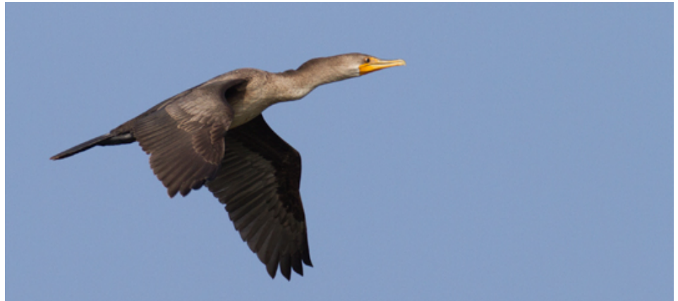
Double-crested Cormorant