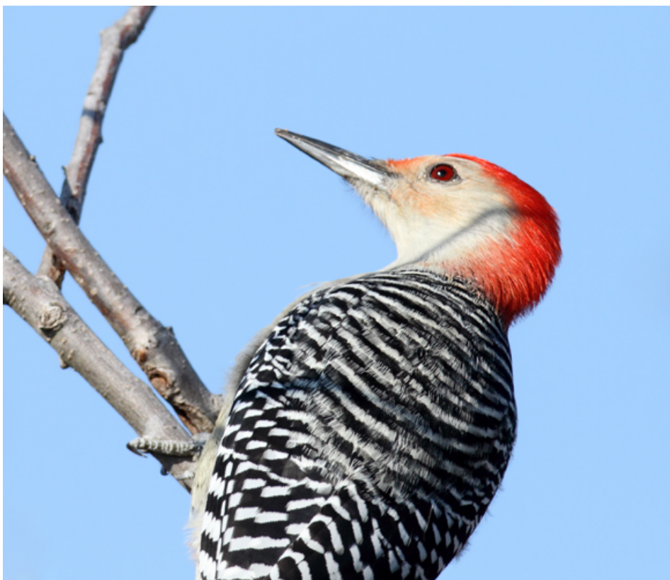
Red-bellied Woodpecker