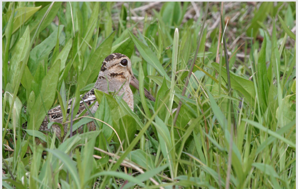
American Woodcock