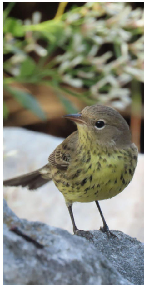
Kirtland's Warbler, Swann Park, Baltimore, MD