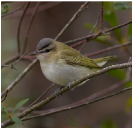
Red-eyed Vireo

I couldn't help but think to myself..... They must be having a great day at the CVP Hawk watch.