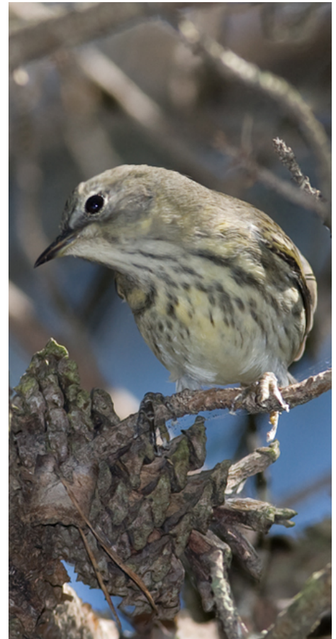
Cape May Warbler