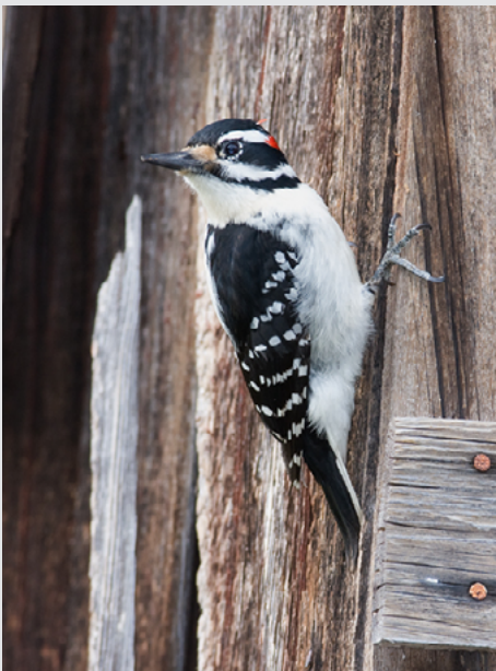
Male Hairy Woodpecker