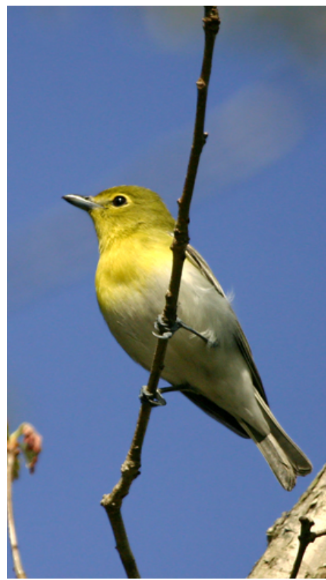
Yellow-throated Vireo