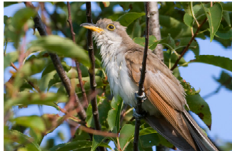
Yellow-billed Cuckoo

We talked about Lights Out and I showed them the map of the US at night to explain.