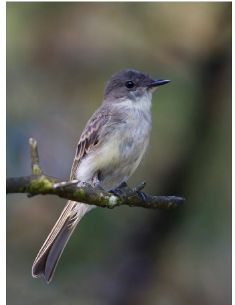
Eastern Phoebe

Further along, we heard an Eastern Towhee and finally saw 2 Eastern Towhee later on. Continuing halfway down the Serpentine Trail, we found a variety of mostly "winter" birds such as Ruby 3 Crowned Kinglet, American Redstart (3 juvie or female), 1 White-Throated Sparrow, and 1 Downy Woodpecker. Heading towards the Visitor's Center, we spotted an Eastern Phoebe as well as 2 White-Breasted Nuthatch, 2 Creepers, and 3 Golden-Crowned Kinglets. 24 species in total.