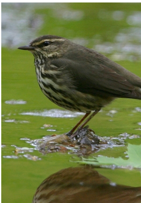
Northern Waterthrush