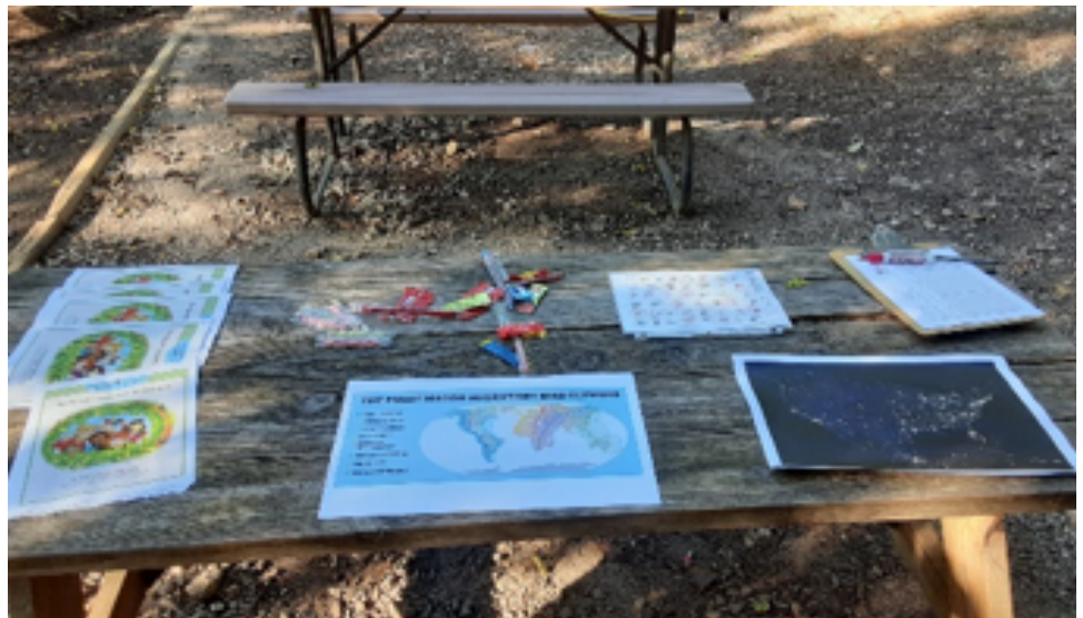
Bottom Left and Right: Photos from the September 11, 2021 Coppermine Fieldhouse youth trip.