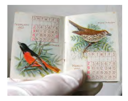
"American Singers" Calendar 1902