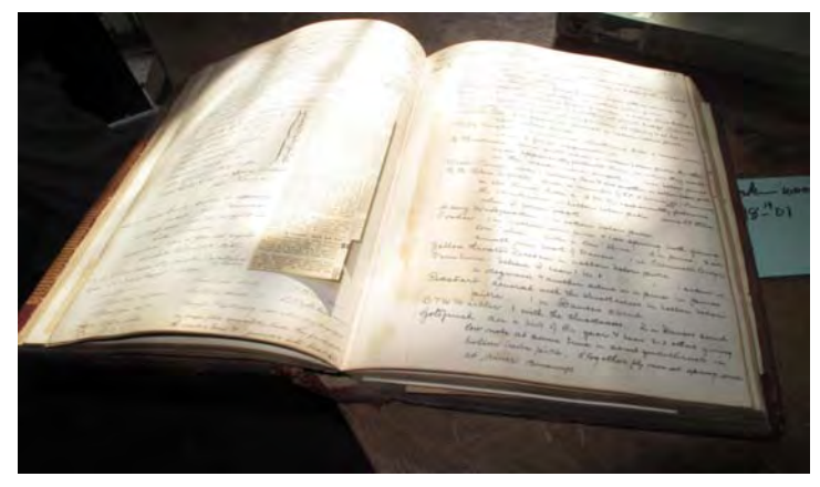
Frank Kirkwood's Field Note Journal

Most of these items currently reside at Cylburn Arboretum but some items are located at MOS sanctuaries. The specimens and journals are available for research and educational purposes, but because there is no catalog or inventory most people do not know of this hidden treasure. This also impedes professional archival management of these collections. One of the biggest problems is that there is no independent humidity or temperature control, although some of the collection is stored in airtight metal cabinets. Light, insects, mold and moisture pose serious threats to the collections. An equally serious problem is that loss of associated data regarding the origin, date, collector, and other information not evident from the item itself could substantially reduce the value of the collection for interpretation.