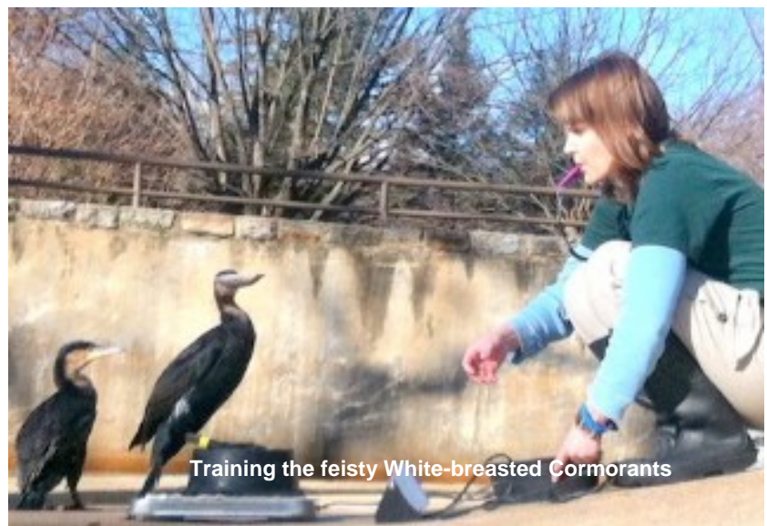
(Continued on page 11)

Another challenge but the greatest reward as an avian keeper is training your birds. Training is vital to being a good keeper. It eliminates