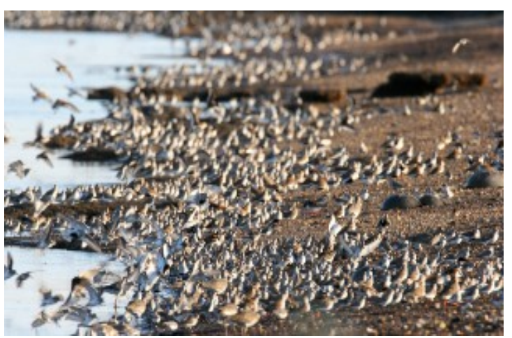
Thousands of shorebirds feeding along Port Mahon Rd, Delaware