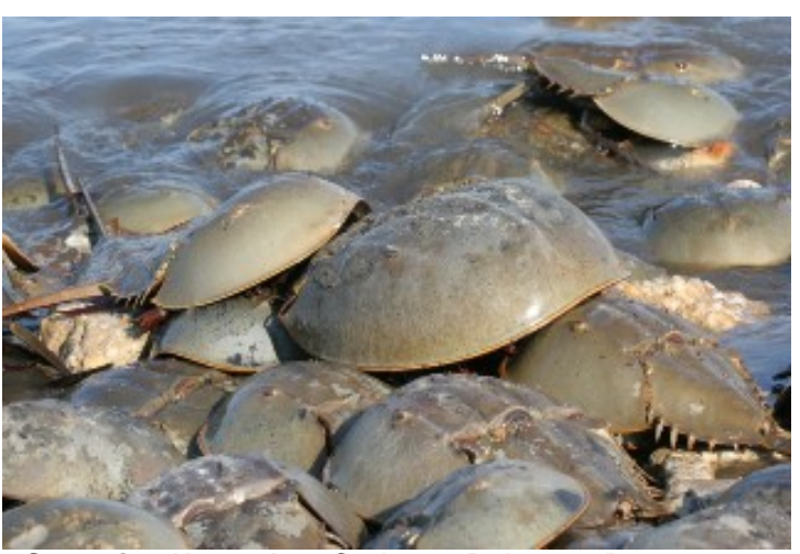
Spawning Horseshoe Crabs on Delaware Bay