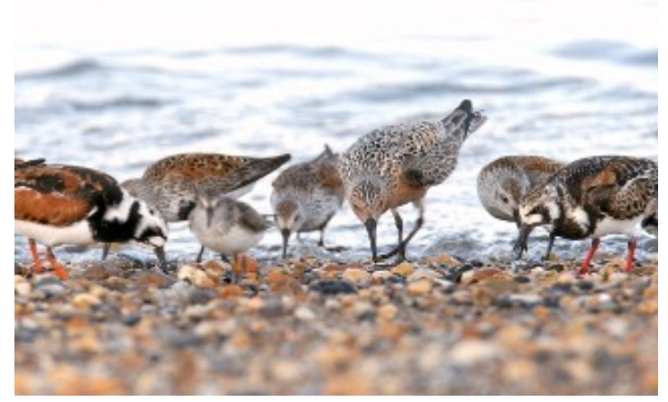
Thousands of shorebirds feed on the Horseshoe Crab's eggs and depend upon this annual feast to fuel their long northward migration, including the Red Knot (3rd from right)