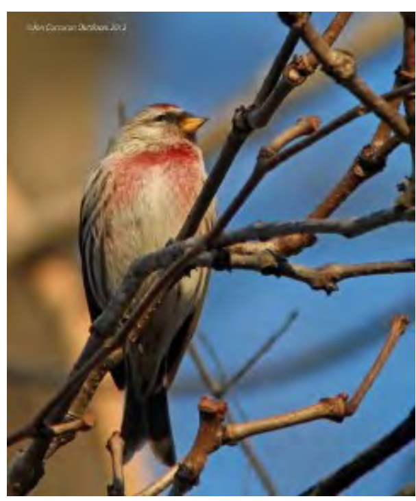
Common Redpoll at Fort Howard