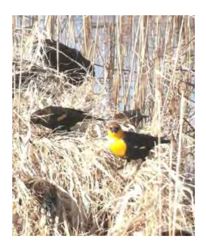
Yellow-headed Blackbird on Hart-Miller Island