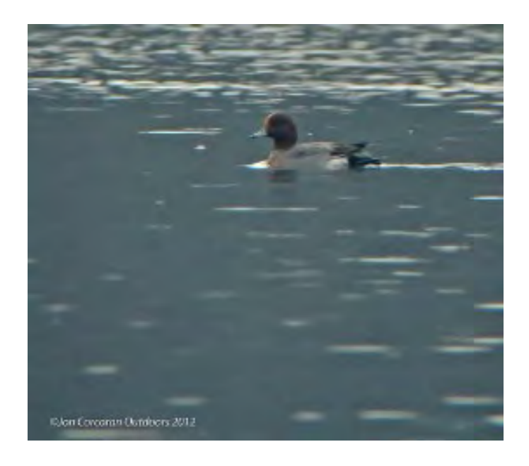
Eurasian Wigeon in Baltimore Harbor