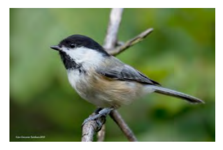
Black-capped Chicadee in Monroe, PA